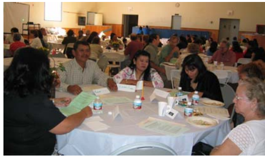
Table host leads conversation at Guadalupe Town Meeting.

"Think of a child who is very near and dear to your heart. What do you want the schools in Guadalupe to do for this child?" The same question was asked regarding Righetti High School (the high school in Santa Maria that serves the Guadalupe community).