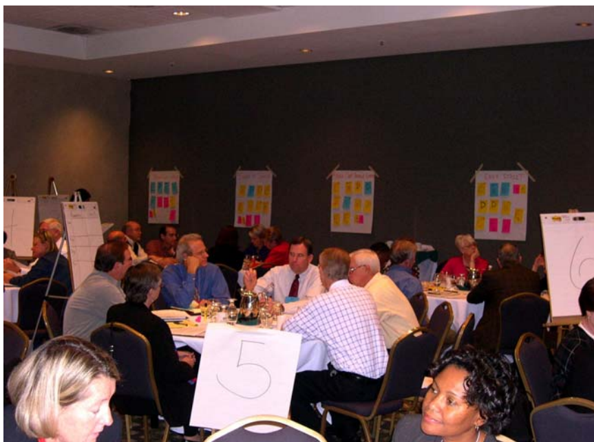
Tripartite Council at work in Salt Lake City.

Note: see page 4 for members of the Tripartite and Governing Councils.