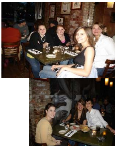
UNK STUDENTS IN BROOKLYN

The visiting students were also treated to a wide variety of other experiences.